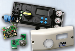
4-20 Feedback and micro switches are available

Available in Hart, Foundation Fieldbus, or Profibus in Nema 4X, IS, or EX ratings, this versatile product can be mounted and commissioned in minutes. Micro switches or position feedback can be factory mounted. And our in stock mounting kits add more flexibility and support for this complete product line.