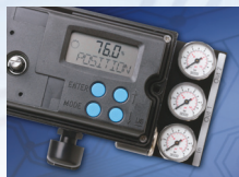
Simple calibration—push one button twice—a standard loop calibrator is all that is needed—LCD screen