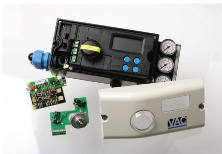
Standard Unit with Feedback options