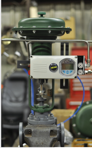
Rotary or Linear