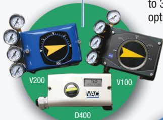
A Complete Product Line

From day one, VAC has always done business with a "customer first" approach. The VAC PAC of quality positioner products includes the simple V100, versatile V200, the digital D400; specials like Nickel or Tufram® coated, -40 to 325F, and various positioner feedback options. Also available is a flexible mounting kit program for rotary or linear actuators, for new mountings or retrofitting most popular brands in the field.