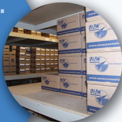
Quick Ship Inventory

The VAC PAC Value... Saving YOU Time and Money