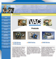
Comprehensive Web Site

We take pride in our "customer first" staff that will help you find the right positioner for your needs without a maze of phone directories and extensions. Our competitive pricing and excellent service set us apart from the others.